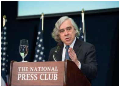
U.S. Secretary of Energy Ernest Moniz

“We are going through a revolution in the energy business”, the U.S. Secretary of Energy Ernest Moniz said addressing the release of the Obama