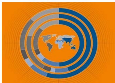
The Report's cover illustrates CO2 emissions as distributed per region in 2010 and as projected by the two World Energy Scenarios by 2050.

The World Energy Council's Secretary General Christoph Frei will present the 2015 World Energy Trilemma report "Priority actions on climate change and how to balance the energy trilemma" at the 6th Clean Energy Ministerial (CEM) taking place on May 27-28 in Merida (Mexico). The Report's findings will provide direct input into the Ministerial discussions around key policies and