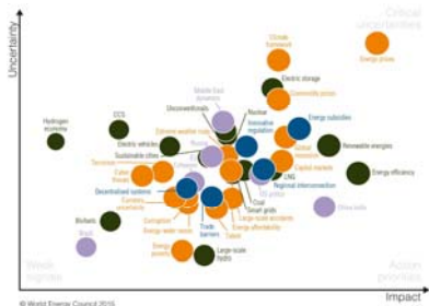
The map highlights 40 issues and their perceived impact, uncertainty and urgency for energy leaders globally

What are the issues that energy professionals perceive as critical this year? What are the biggest changes, what stays the same?